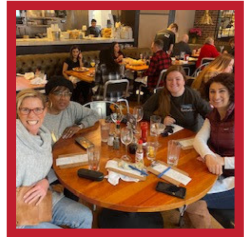
Training and Inclusion's Holiday Brunch

The goal of the Training & Inclusion Committee is to plan and execute training sessions for members on various leadership and development topics in alignment with our league's commitment for promoting voluntarism throughout the community, building connections within the league, and supporting membership leadership potential.