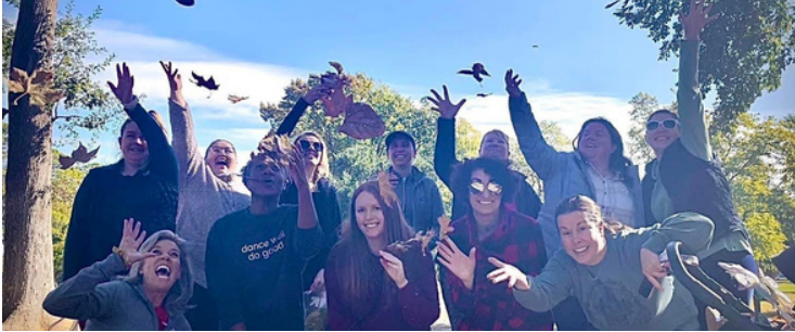
Annual Gratitude Walk