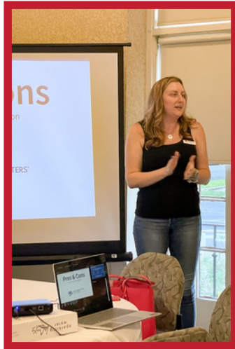
Ballots and Bubbles