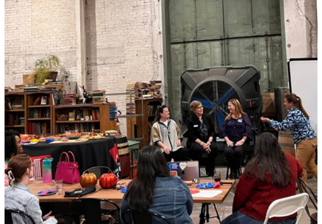
Educational "Bites" at October's GMM past presidents discuss their Junior League experiences