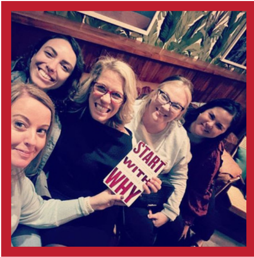
Book Discussion and Happy Hour